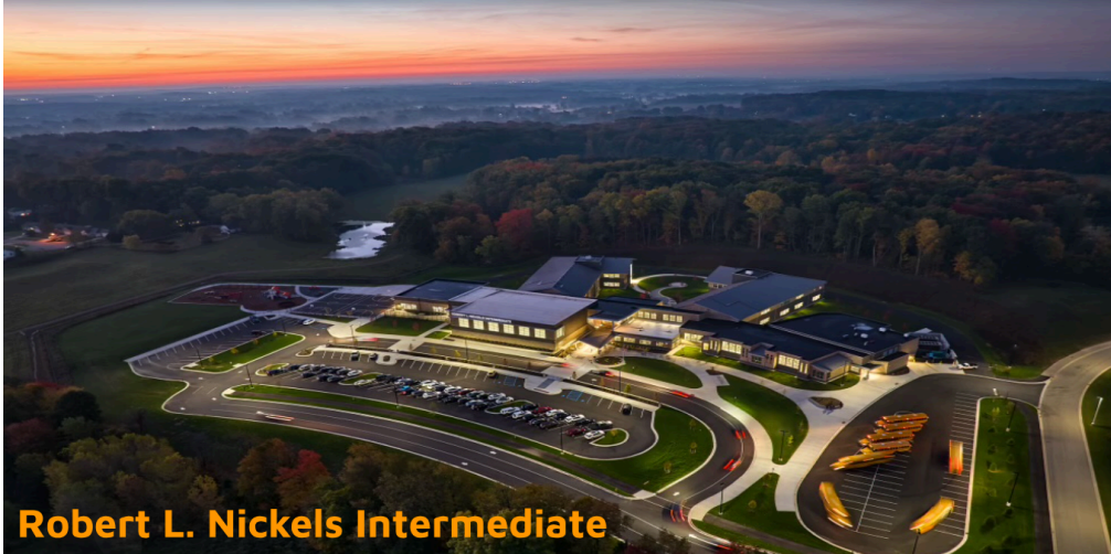
Robert L. Nickels Intermediate

Nickels Intermediate School Friday Office Communication October 4, 2024