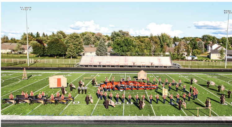
Official photo of the BCHS Marching Band

State Solo and Ensemble: 23 First Division ratings and Seven Second Division ratings