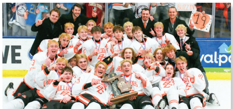
Hockey D2 State Champions