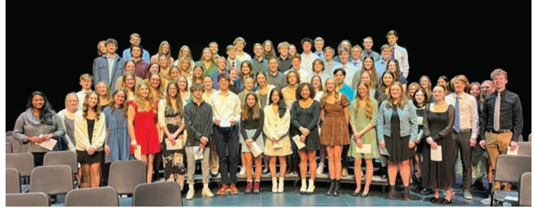
National Honor Society recognized 31 new members inducted for the 2022-2023 school year

Let's also congratulate Byron Center High School's 2022-2023 National Honor Society members' success. Thirty-one new members were inducted this school year. NHS recognizes outstanding high school students for their academics, leadership, service, and character. Students with a 3.5 GPA can apply for membership when they are sophomores.