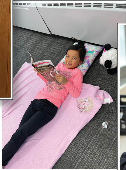
Even your stuffed animals like to hear a good book.

Reading makes your future so bright; you'll need to wear shades!