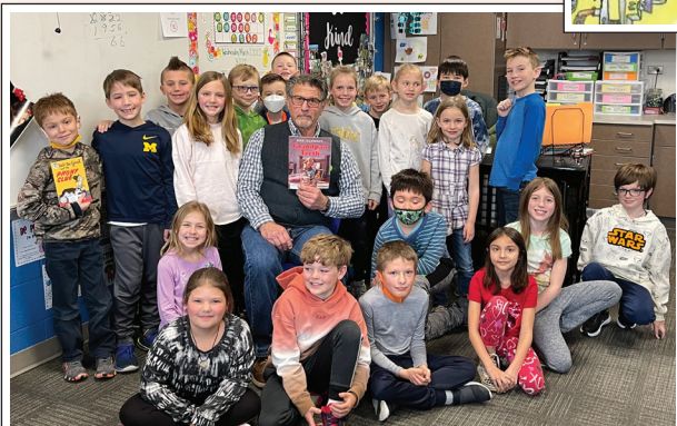
Guest speakers join in the fun at Brown.

Even the halls get decked out for Reading Month!