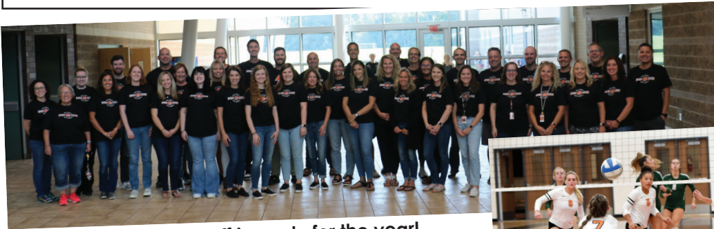
WMS Staff is ready for the year!

Non-Profit Org. U.S. Postage PAID Grand Rapids, MI Permit No. 564