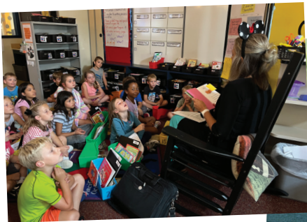
Students are eager to listen and learn