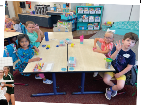
First week of school excitement!