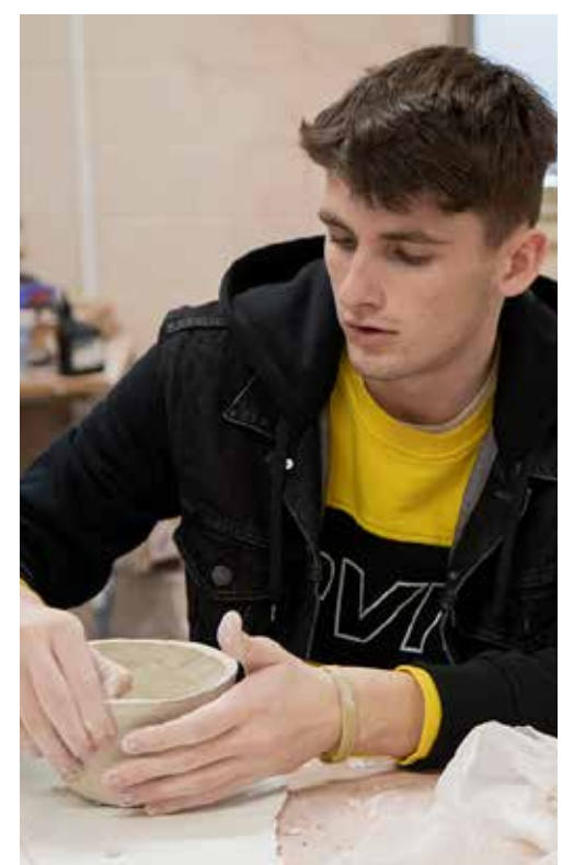
What an extraordinary group you have become! Please carry your passion and drive as you move forward on your journey, for these will keep you strong and aware. It's time to start moving mountains, and I have faith that you will make this world a better place! Congratulations!