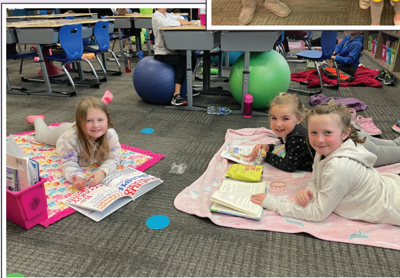
Sunny smiles with friends at Brown!