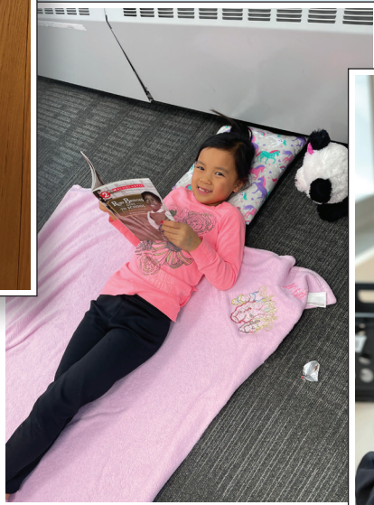
Even your stuffed animals like to hear a good book.

Reading makes your future so bright; you'll need to wear shades!