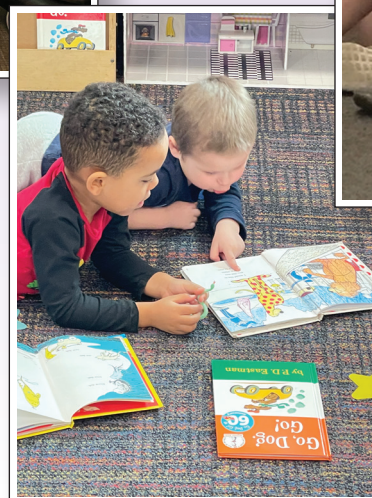
Reading buddies share a book at the Early Childhood Center.