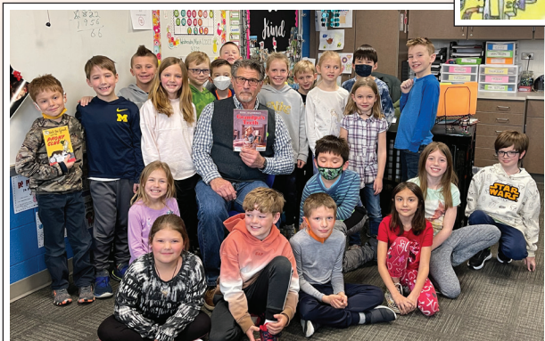
Guest speakers join in the fun at Brown.

Even the halls get decked out for Reading Month!