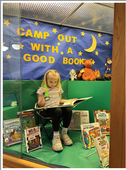
Camping out with a good book at Marshall.