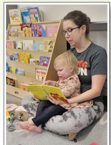
Our Early Childhood Centers understand the importance of early reading!

ELA 12 took a novel approach to Reading Month by exploring how young adults interact with modern text. In this case, they used literary nonfiction--in a podcast--to analyze and evaluate information presented on an ongoing court case. A Mock Trial was the final push to sharpen their verbal argumentative skills as each side presented evidence, examined witnesses, and fought for their desired verdict.