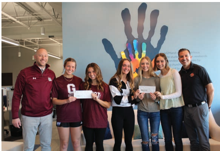
Grandville and Byron Center Bulldog students and administrators unite for a good cause