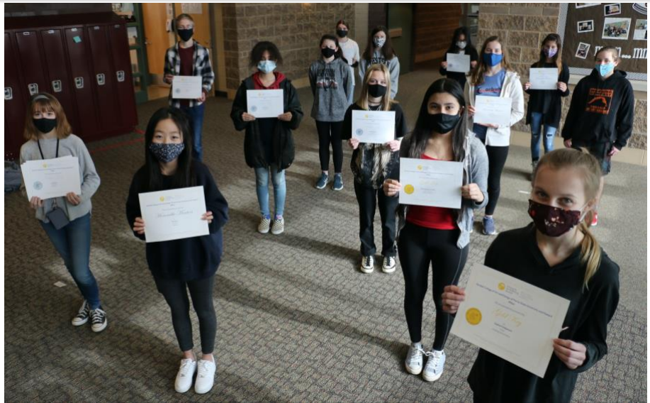
WMS Students were celebrated on March 6 th for the 2021 West Central Michigan Scholastic Art and Writing Awards. Go to page 5 to read more about the winning works.