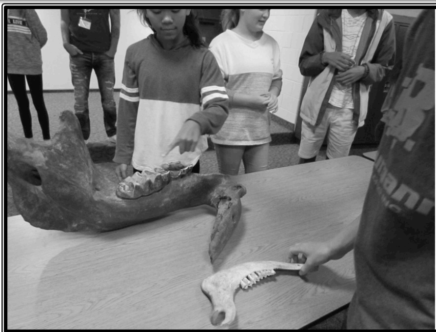
7 th and 8 th grade students had a chance to get a hands-on experience with history when the mastodon bones discovered at a recent Byron Center building site made their way to WMS. Students compared the size of the mastodon bones to that of a cow to show scale and weight.