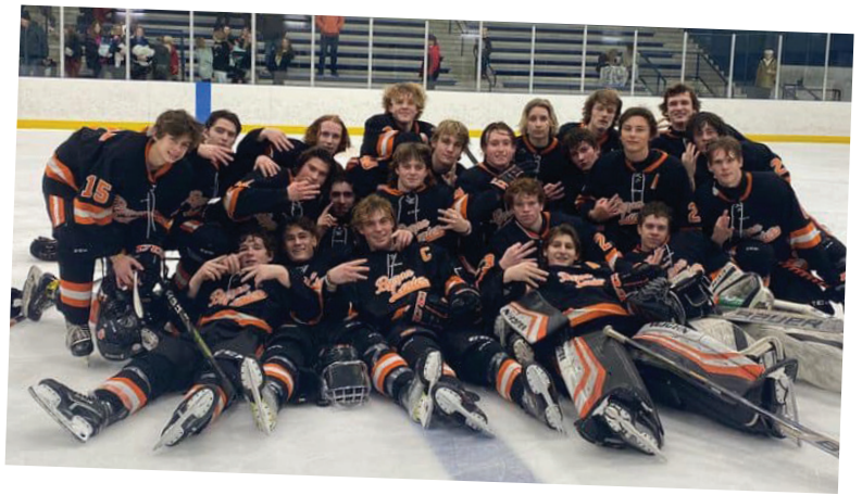
Hockey Conference Champs