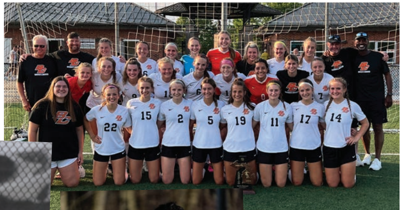
Soccer District Champs