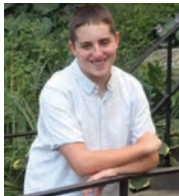
Aspen Matthews Integrity