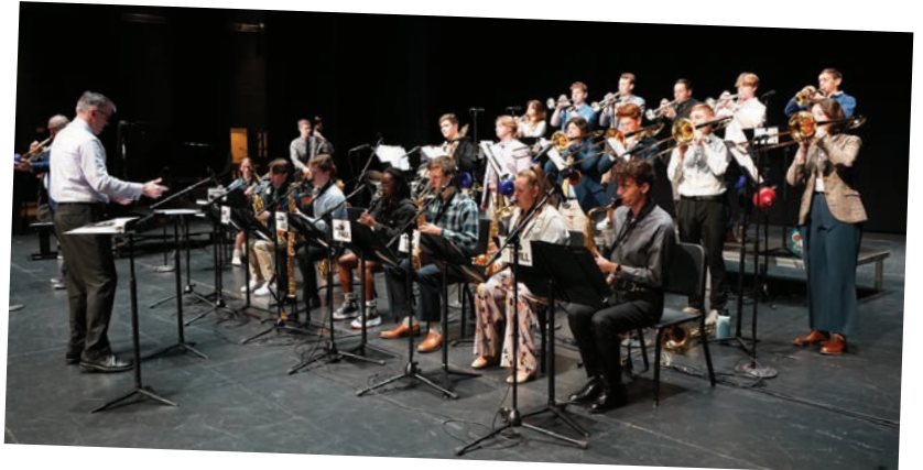
Jazz Orchestra practicing for performance