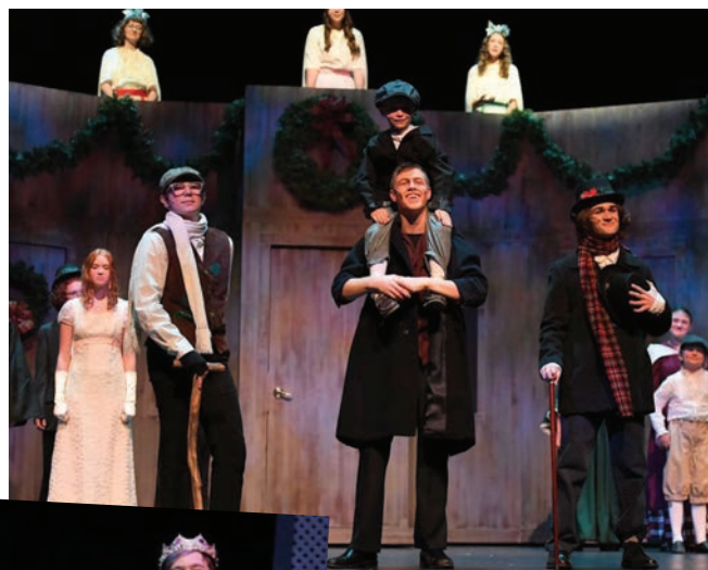
Fall Play: A Christmas Carol