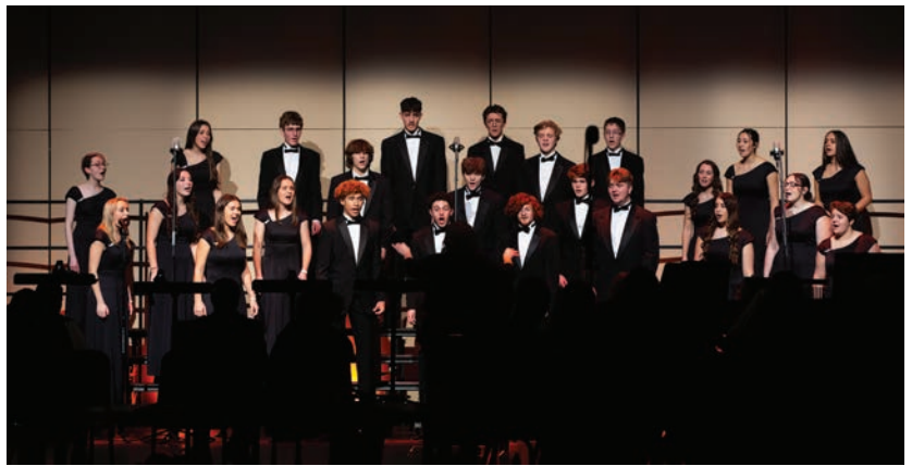
Vocal Expressions perform at Artastic

Five First Division Ratings & One Second Division Rating