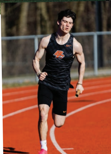
Jackson Perez Bulldog Award