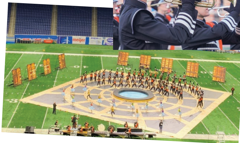
Marching Band performs in the State Competition at Ford Field

18 Students Awarded Outstanding Performance & Jazz Band Named Outstanding Ensemble