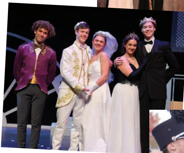
Spring Musical: Cinderella