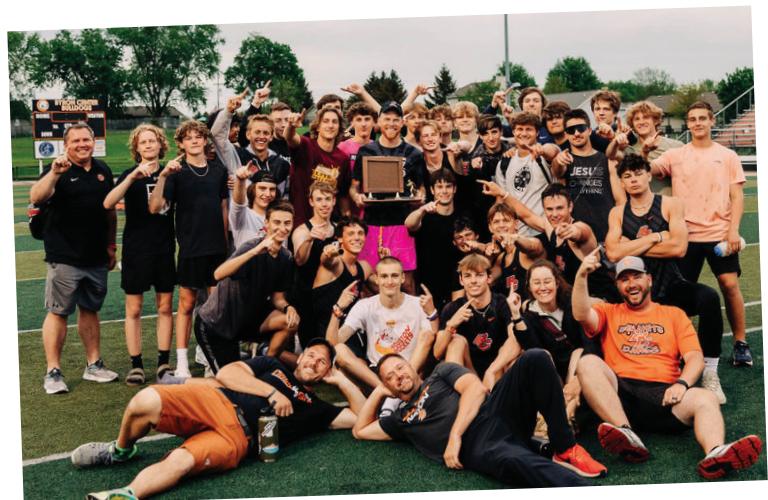
Conference Boys Track