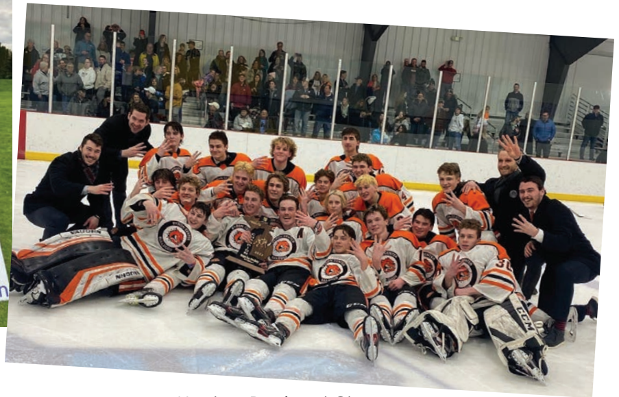
Hockey Regional Champs