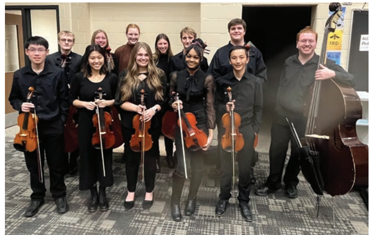
BC Orchestra Seniors