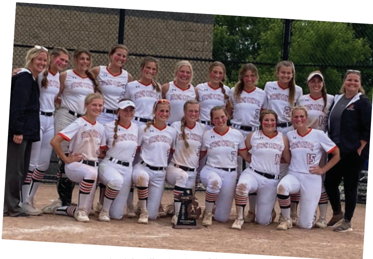
Softball District Champs