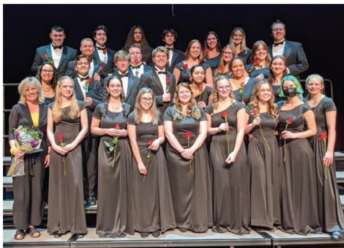
Senior choir members at the spring concert

“Dear Class of 2022, if I could choose a word to represent your class, it would be “family.” In our most challenging year yet, I watched you love and support each other like no other class I’ve seen. You laughed together, cried together, encouraged each other, chastised each other, hugged each other, helped each other, set and achieved goals together, failed and learned together, and were not afraid to share your true selves with each other. Your courage to do life together and be authentic inspires me. Continue to love and serve others and continue to use your unique gifts and talents to improve the lives of those around you, and you will make this world a better place!”