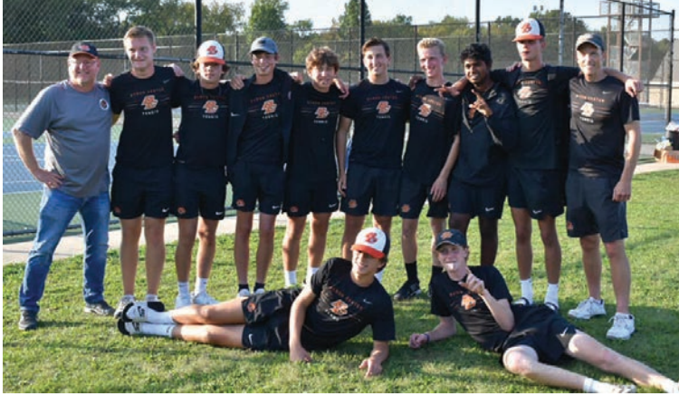
Boys Tennis State Qualifiers