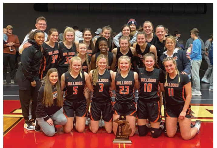
Girls Basketball Conference and District Champs