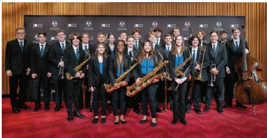
BC Jazz Orchestra