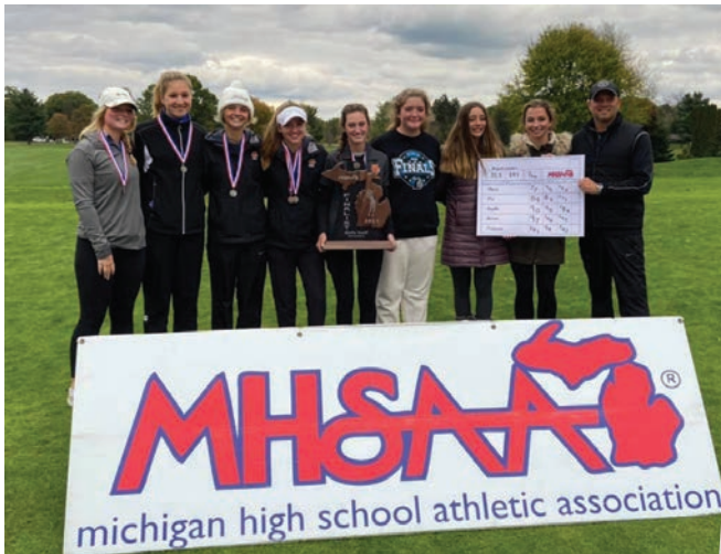
Girls Golf Conference and Regional Champs State Runner-Up