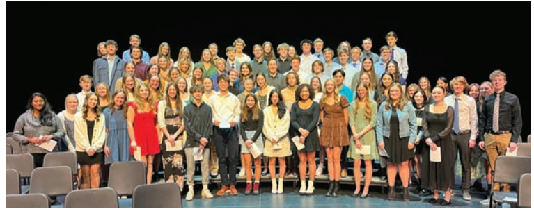
National Honor Society recognized 31 new members inducted for the 2022-2023 school year

Let's also congratulate Byron Center High School's 2022-2023 National Honor Society members' success. Thirty-one new members were inducted this school year. NHS recognizes outstanding high school students for their academics, leadership, service, and character. Students with a 3.5 GPA can apply for membership when they are sophomores.